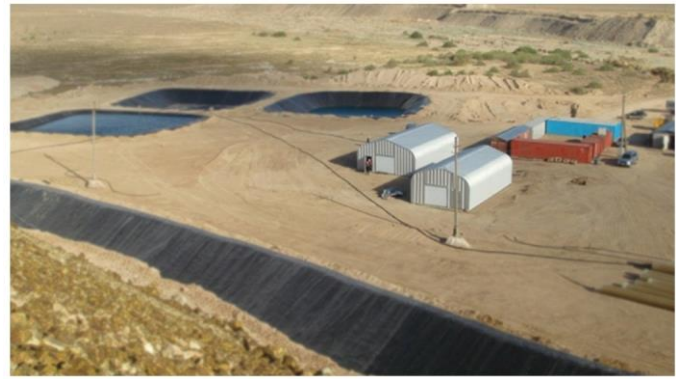
Convenient for Remate Locations