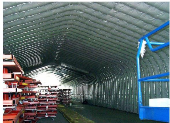
Insulated Conveyor Interiors