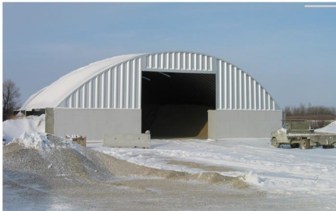
Secure Storage for Sand and Gravel