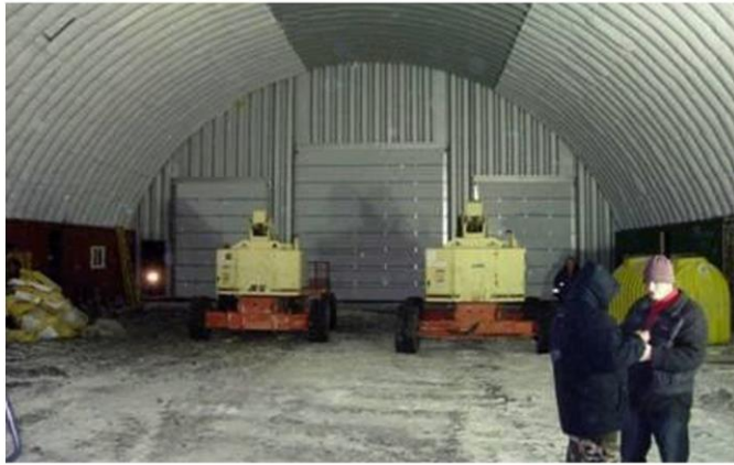
Withstands Harshest Weather Conditions