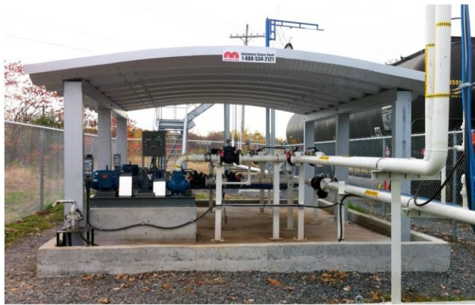
Customized Roofing Systems