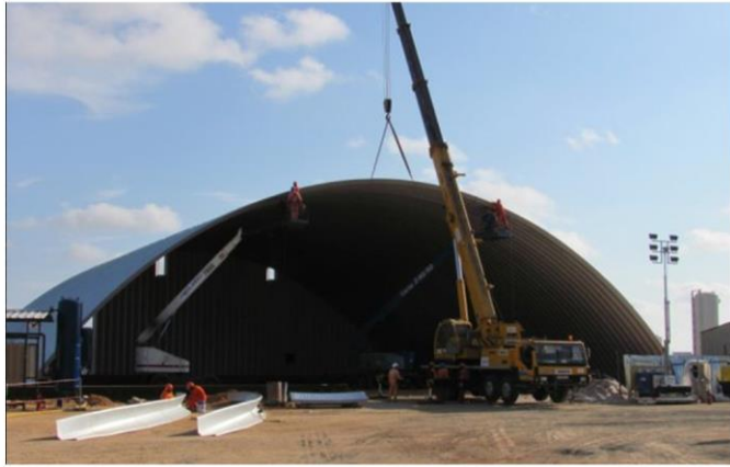
Incredible Clear Span Widths