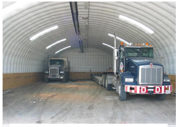
Ideal for Heavy Vehicle Storage