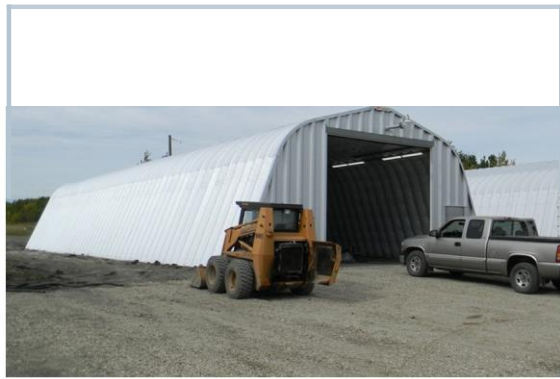
Heavy Equipment Maintenance