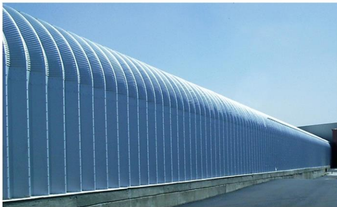
Any Length Conveyor Covers