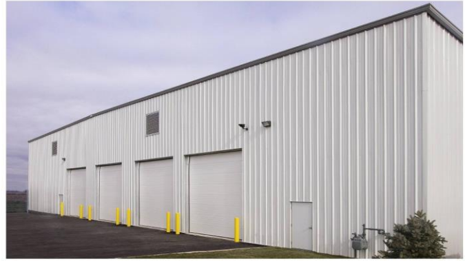
Heavy Equipment Garages