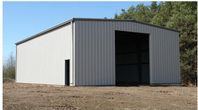
Maintenance and Repair Shops