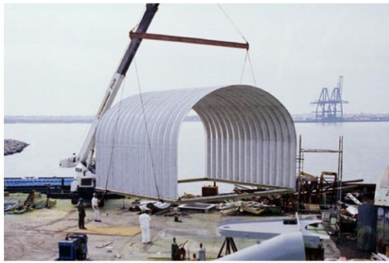
Portable and Lifiable